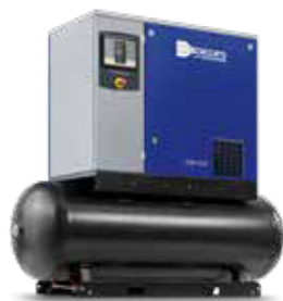
Tank Mounted version with integrated dryer