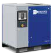
Floor Mounted version without integrated dryer