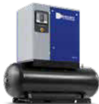
Tank Mounted version without dryer